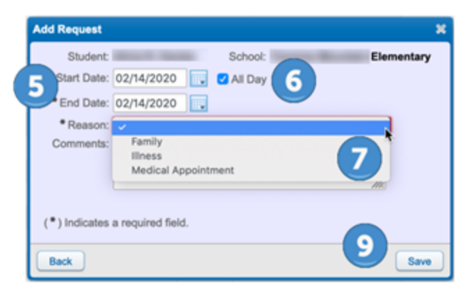
Figure 3. Add a Request

9. Click 'Save'. Submitting an online Absence Request will be forwarded to the school Secretary. The school Secretary will review the request and will either approve it or deny it. You will receive a notification via email of the status of your request.